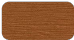
10206910 Pecan Woodgrain