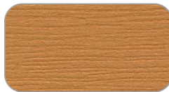
10206912 Sugar Maple Woodgrain