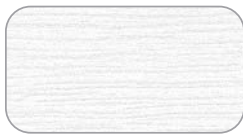
10206900 Bone Woodgrain