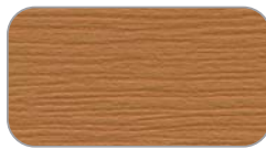
10206906 Golden Oak Woodgrain