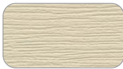
10206901 Cream Woodgrain