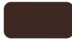
10206908 Mahogany Woodgrain