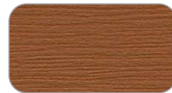
10206913 Warm Cherry Woodgrain