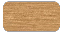
10206909 Natural Woodgrain