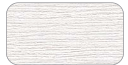
10206902 White Woodgrain