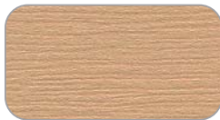
10206911 Sand Woodgrain