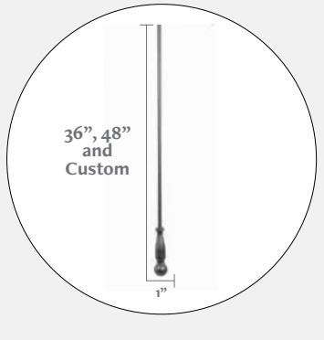
BATON #HCWRCWND36 / 48